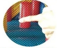
Protection safety net