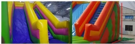
Safety lanes and perfect body shape