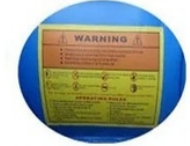
Safety warning sign