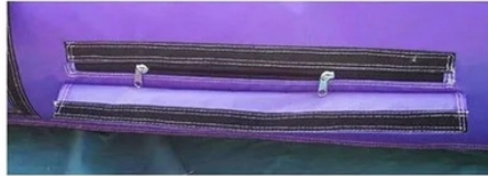
Zipper gas vent with safety cover