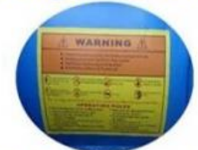
Safety warning sign