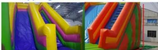
Safety lanes and perfect body shape