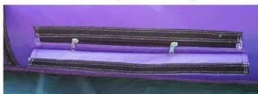
Zipper gas vent with safety cover