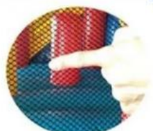
Protection safety net