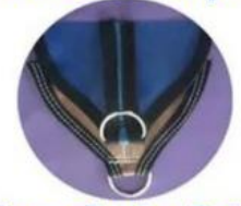
Strong fixation D-ring