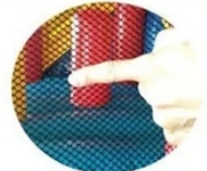
Protection safety net