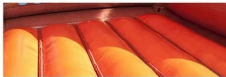
Double reinforced strips