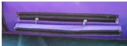
Zipper gas vent with safety cover