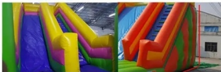
Safety lanes and perfect body shape