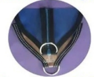
Strong fixation D-ring