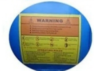
Safety warning sign