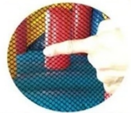
Protection safety net