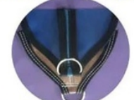
Strong fixation D-ring