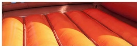
Double reinforced strips