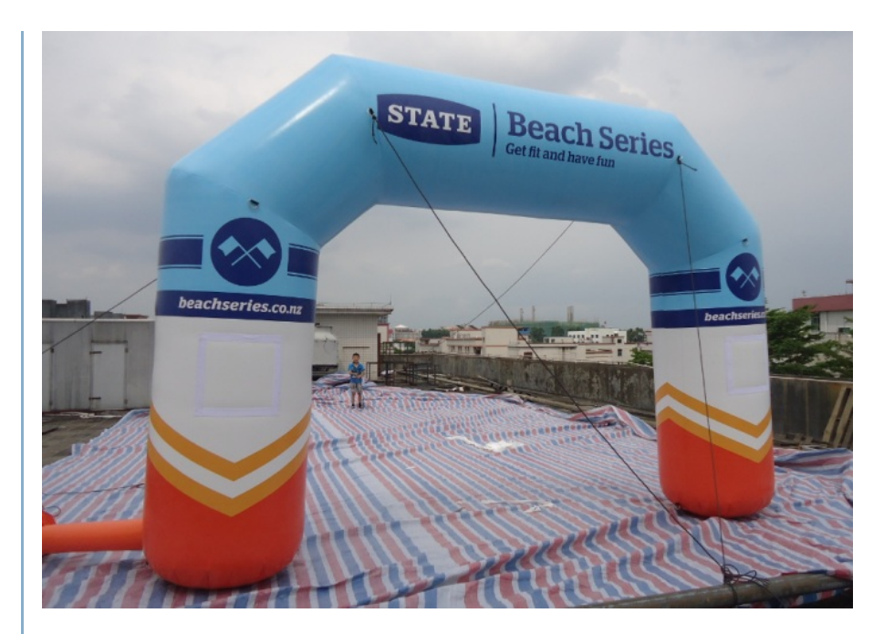
Here below are some other model inflatable arched for your reference: if you like it , please tell us.