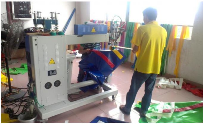
5, Testing 4-24hours(confirm all the functions are well)