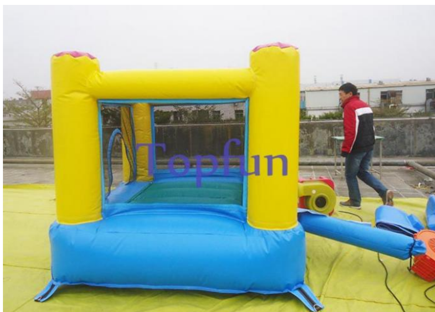
Amusement Park Commercial Bounce Houses Oxford fabric Inflatable Bouncer