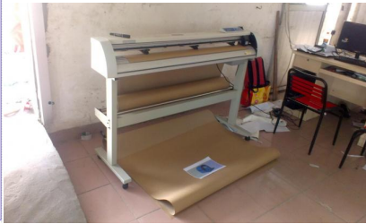
3,Cut the material according to the design;