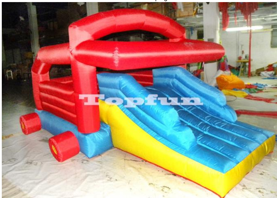
Custom Commercial Bounce Houses / Inflatable Jumping Bouncer Oxford Fabric