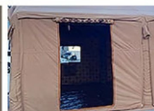
4. FRONT GATE