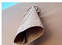
2. PULL RING