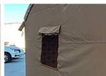
3. SIDE WINDOW