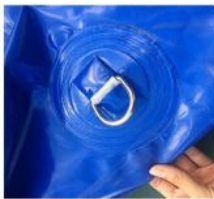
Strong D-rings for fix the screen