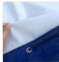
Adjustable elastic band for movie screen