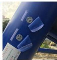
Double inflation valve with cover