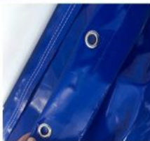
High quality circular ring