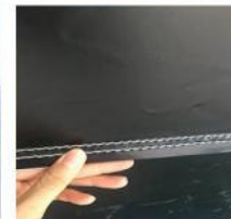
High density opaque coating double needle car without wrinkle stitching