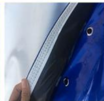
4-needle stitching edge